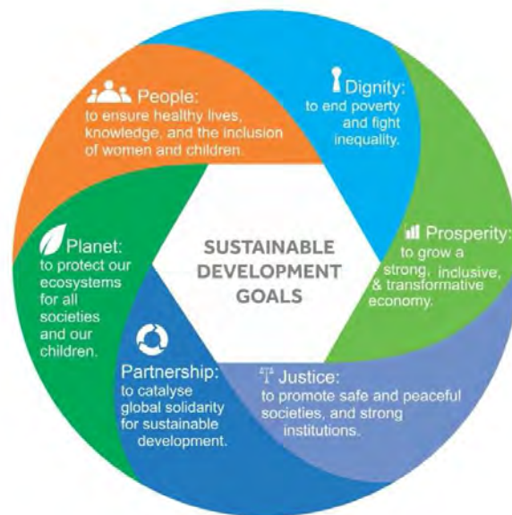
Figure 1. Six essential elements for delivering the SDGs

66. The following six essential elements would help frame and reinforce the universal, integrated and transformative nature of a sustainable development agenda and ensure that the ambition expressed by Member States in the outcome of the Open Working Group translates, communicates and is delivered at the country level (Figure 1).